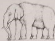
How many legs this elephant have?