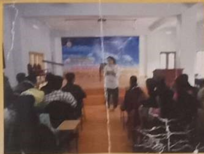
Softskill Development Workshop